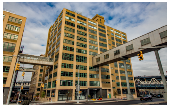
The highest priced industrial/office transaction was a four building portfolio in DUMBO which sold for $408M in March. The portfolio includes four buildings totaling approximately 644,000 gross SF.