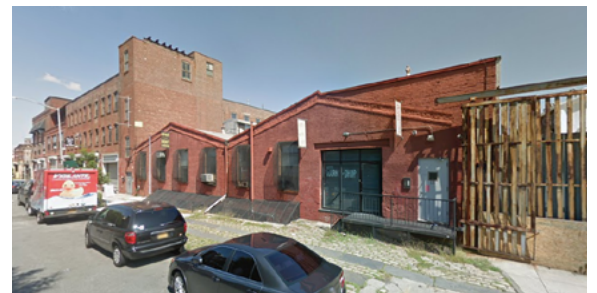
The industrial/office transaction with the highest price per SF was 131 8th Street in Gowanus, which sold for approximately $1,685 per SF.

This study shows Brooklyn commercial industrial/office building transactions for 2017, broken down into region and neighborhood. Considered data points include: total dollar volume, total number of transactions, average sale price, total square footage sold and average price per SF.